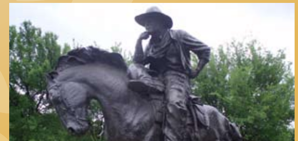
Artist: Robert Summers

In a joint effort with Texas DOT, more than 3780 trees have been planted along the Woodall Rodgers Freeway between North Central Expressway & Stemmons, at the interchange between Highway 75 & Woodall Rodgers Freeway and at the intersection of I-30 & Highway 80.