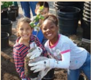
Volunteers make a difference!

Locke Lord Bissell & Liddell, LLP Texas Instruments Incorporated Lyco Holdings Incorporated Dallas Morning News Sprinkles Cupcakes Richland College Rees Associates Bank of America TXU Energy Esurance Lambert's WFAA-TV